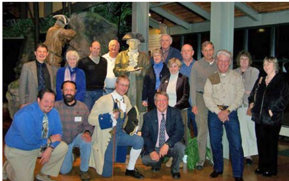
2007 seminar speakers and BRPA board members gather at Fort Necessity after last year's seminar