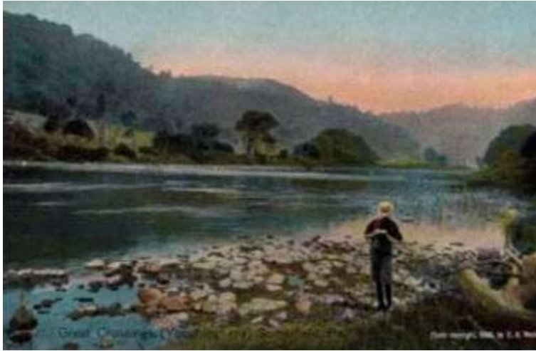
GREAT CROSSINGS, (YOUGHIOGHENY) SOMERFIELD. General Braddock crossed the Youghiogheny on June 24. It is difficult to determine the exact fording of the river. The most natural place seems to be just below the mouth of Braddock Run. Orme says the river was "about one hundred yards wide, about three feet deep, with a very strong current." At any rate he crossed the river, without bridging, about half a mile above where the National Road now crosses it. (See Cumberland Road Series E.)