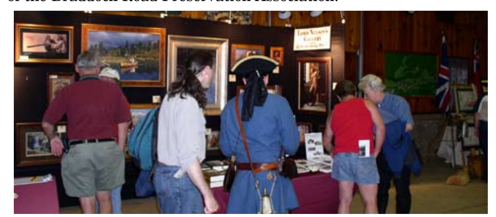
Jumonville French & Indian War Seminar #17

Where is BRPA going next? You can help us decide! Donations to the BRPA are tax deductible and a great way to help preserve some of the most historic ground in America. We also always welcome volunteers for various projects and a few good men and women each year to serve on the board of directors and help fulfill our mission of preserving the site of Dunbar's Camp, the Braddock Road trace, and other significant French and Indian War sites. Please contact Walt Powell through Jumonville (724) 439-4912 to make a donation, volunteer, or have your name entered into consideration for the board of the Braddock Road Preservation Association.